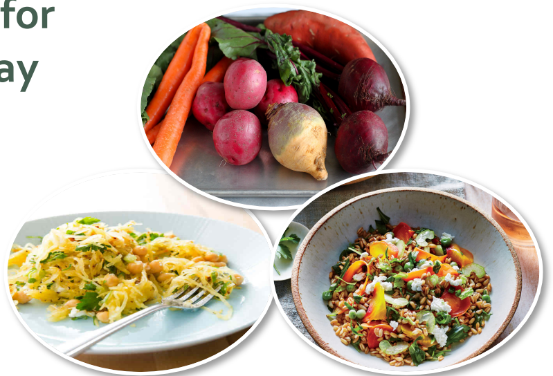
Whole Root Veg, Spaghetti Squash “Pasta” and Stir Fry with 5:1 Grains

#4 Learn Great Tasting Recipes: Complex carbs like hulled barley, acorn squash, radish, yellow lentils, and even grapefruit deserve a delicious preparation, just like your beef and chicken. Hearty carbs need seasonings, appropriate cooking techniques and recipes. Get them!